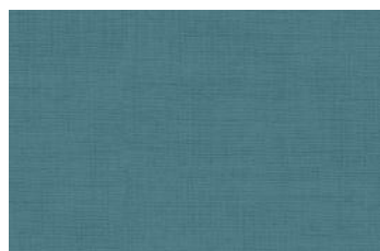
1473/T6 Linen Texture