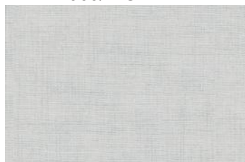
1473/S2 Linen Texture