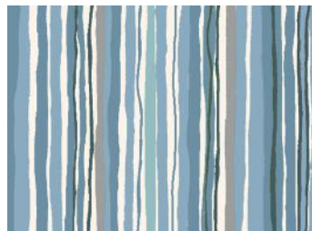
1899/B2 Wavy Stripe