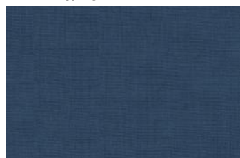
1473/B8 Linen Texture