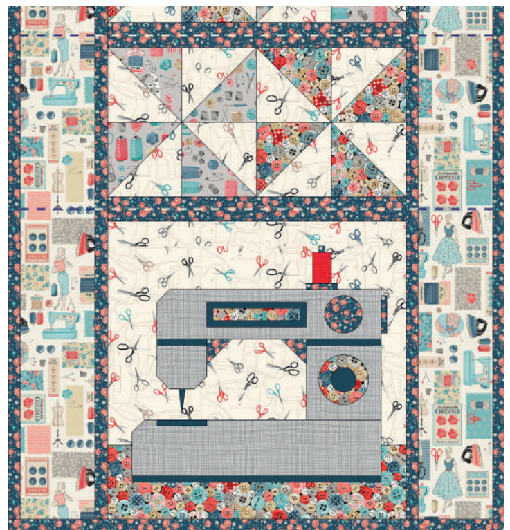
Sewing Machine throw cover by Lynne Goldsworthy of lilysquilts.blogspot.com Finished size 20" x 33" (50cm x 80cm) Download free from www.makoweruk.com