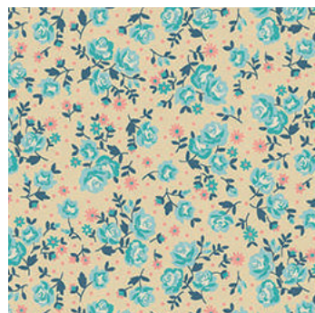
2140/Q Ditzzy Floral