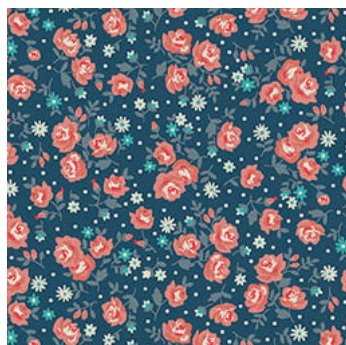
2140/B Ditzzy Floral