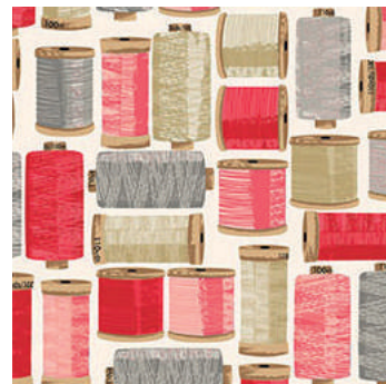
2139/P Cotton Reels