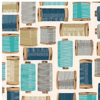
2139/B Cotton Reels